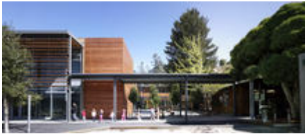
Overview of the Learning Center and Courtyard

Marin Country Day School's Strategic Plan aspires to make ecological literacy an integral part of its curriculum, and to reinforce the students' sense of connection with nature on their very special site. Throughout the design process we worked to develop synergies between the physical campus and the school's educational program that would allow students to creatively tackle real, local issues using all the tools at their disposal. The students participated in the design process, researched options, documented the construction, monitored results, and taught their parents about the buildings once they were complete.