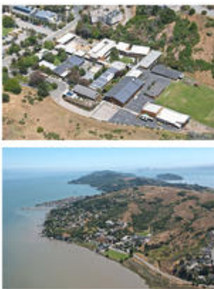
Marin Country Day School includes an entire watershed.

MCDS' strategic plan has an explicit commitment to give students a strong foundation in ecological literacy and leadership training so they are prepared to take on our future global challenges. Students participated in the design process and the building was designed to encourage their ongoing participation in and understanding of the building's operation.