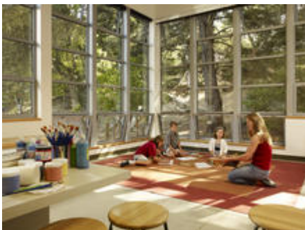
Clerestory monitor provides daylight and natural ventilation.