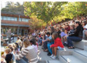
Trees in Step Up connect courtyard landscape to site beyond.