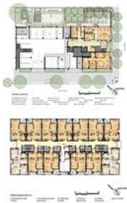
Floor Plans - Photo Credit: Architect