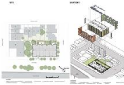
Site and Context Plans - Photo Credit: Architect