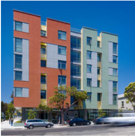
Merritt Crossing Senior Apartments - Photo Credit: Tim Griffith

Located at the edge of Oakland's Chinatown, this new affordable senior housing transforms an abandoned site near a busy freeway into a community asset for disadvantaged or formerly homeless seniors while setting a high standard for sustainable and universal design.