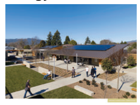
Community Center and Commons