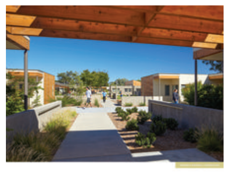
West Entry Threshold from the farm looking towards the Commons