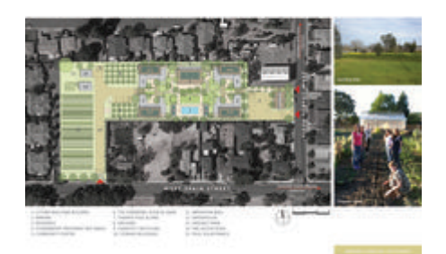
Site Plan for Sweetwater Spectrum Community & Farm - Photo Credit: LMS Architects + Deirdre Sheerin