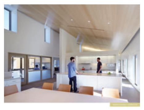
Typical residence living area with balanced daylight, operable windows, and acoustic ceiling with sustainably harvested wood panels.