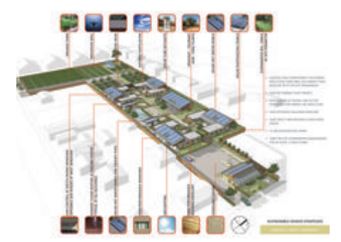
Sustainable Design Strategies - Photo Credit: LMS Architects