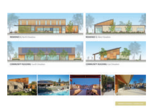
Building Elevations - simple building forms, materials and colors create a calm community environment