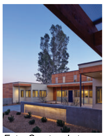
Entry Courtyard at Residence