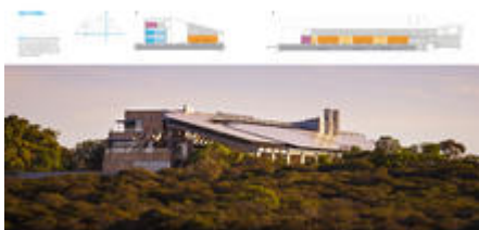
Additional building sections - Photo Credit: © Nick Merrick