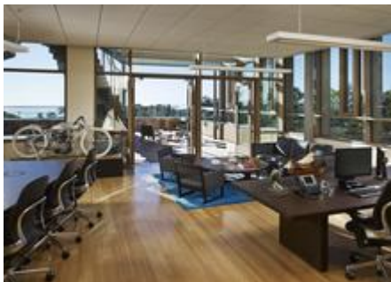
Executive office shows interior finishes against a backdrop of sea and Ecological Reserve vistas.