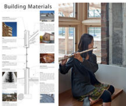
Building Materials/Wall Section (left), Exposed wall section for visual learning (right) - Photo Credit: Opsis Architecture (left), Michael