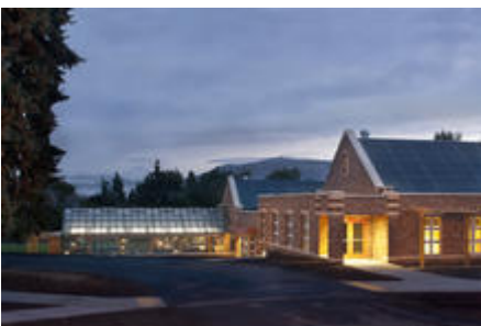
The building is designed for longevity and future growth