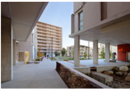
View entering plaza from the south - Photo Credit: Tim Griffith