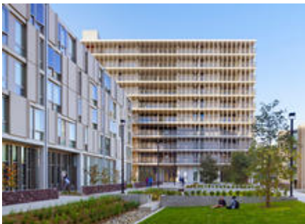
View of courtyard and north tower - Photo Credit: Tim Griffith