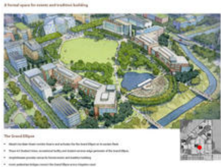
Grand Ellipse