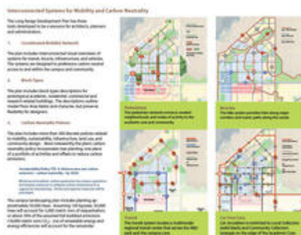
Circulation Pattern