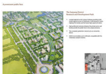
Gateway District