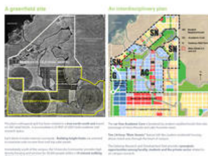
Land Use Plan - Photo Credit: UC Merced