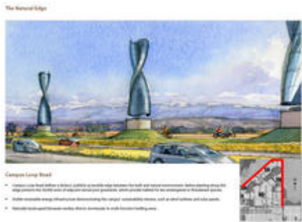
Loop Road