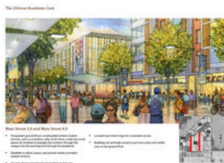
Main Street 2.0