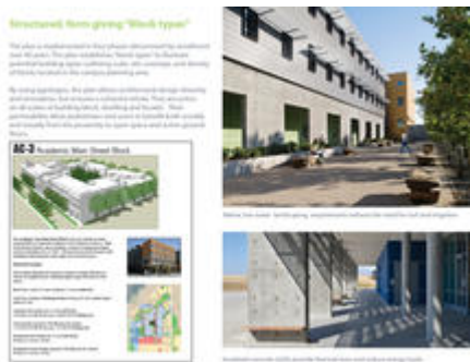
Sustainability Strategies