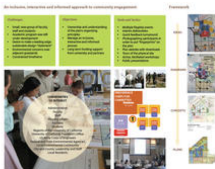
Developing the Plan

Development of this plan was an inclusive, democratic effort among dozens of stakeholders. Workshops held over 18 months with students, faculty, staff and the general public provided critical input during the planning process. Flagship events among faculty, staff, students and designers were the actual genesis of the plan's sustainability targets.