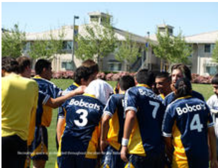
Recreation is embedded throughout - Photo Credit: UC Merced