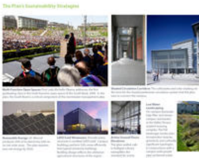
Sustainability Strategies

The Coast Ranges to the west buffer the site from Pacific Ocean weather systems. Summer temperatures are warm to hot and arid, with clear skies, no rainfall and cool evenings. The winters in Merced are mild, with occasional rains and frequent, heavy fogs. In the winter, 30 days of fog are not unusual. Winds come from the northwest during the summer and the southeast during the winter.