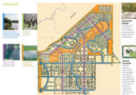
Landscape Plan - Photo Credit: UC Merced