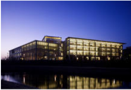
2009 Long Range Development Plan

Located on an 815-acre site in California's fastest growing region, the University of California, Merced's 2009 Long Range Development Plan creates a 21st century urban framework for the University of California's first new campus in 40 years. The plan was adopted by the Regents of the University of California in March 2009.