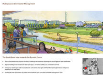
South Bowl