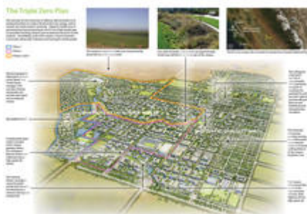
Long Range Plan at Buildout

The plan is based on a compact orthogonal grid that evokes classic Central Valley downtowns, promotes efficient land use, and is oriented to maximize rooftop solar collection. Within the grid, landscape design applies a low-water typology that is contextual and includes tree and shrub selections intentionally designed to attract native birds and other wildlife.