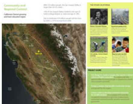
San Joaquin Valley

The site is in California's Central Valley, an agricultural region with some of the nation's poorest economic indicators. The population has the lowest level of college attainment in the state, the highest levels of child poverty, and among the highest unemployment in America. It is also the state's fastest-growing region due to high birth rates. By 2035, it will be 60% Latino.