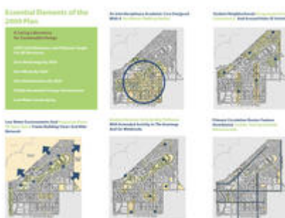
A flexible, orthogonal grid

The campus is organized on a flexible and expandable grid system to organize land uses and infrastructure. Blocks vary in size with a minimum dimension of 300'. Rights-of-way vary in widths but are scaled to support the circulation and open-space objectives of the plan. Utilities