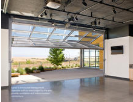
Social Sciences and Management Building

The plan's design standards include daylighting in 75% of interior spaces, operable windows for small spaces and curtain walls along primary views of the grasslands.