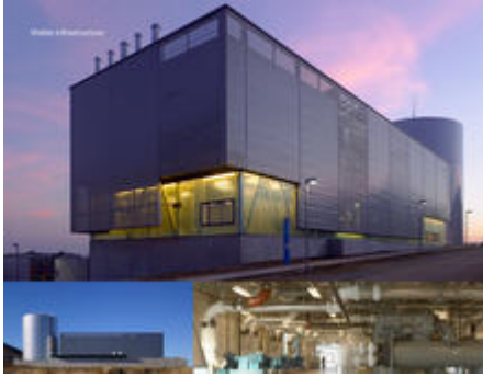
The Central Plant is the core of the campus energy strategy

Currently, the campus Central Plant stores thermal energy in off-peak hours for cooling during peak hours. Water stored in the Central Plant tank overnight is discharged through the chilled water loop the following day to cool buildings without requiring activation of the plant's chillers. This spreads out cooling loads over a 24-hour day and requires less chilled water – thus saving energy without sacrificing comfort.