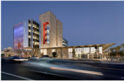
View of council chamber and courtyard at night - Photo Credit: SmithGroupJJR