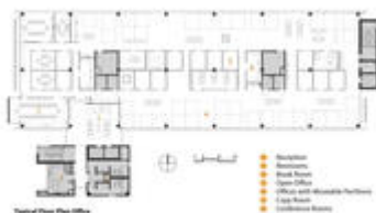
Typical office floor plan -