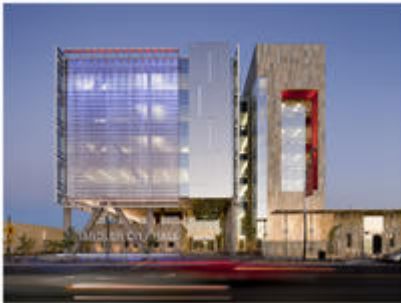
View of office tower from west